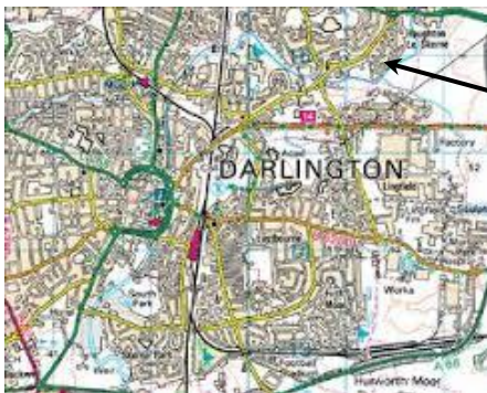
Darlington, and surrounding area

DISCLAIMER: It is the Investors sole responsibility to make a purchase decision or otherwise and you must undertake due diligence you feel necessary to make a fully informed purchase decision. The information and services provided by NGU HomeSalesOnline.co.uk does not constitute financial, investment or tax advice and should not be taken as such. We strongly recommend that you discuss all such matters with a FCA regulated Financial Advisor.