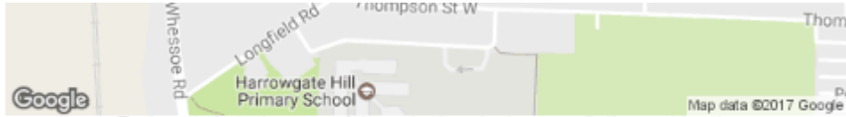
The icons indicate the centre of the postcode and not necessarily the exact location