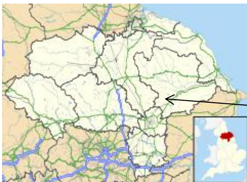
Middlesbrough and surrounding areas

Middlesbrough became a county borough within the North Riding of Yorkshire in 1889. In 1968, the borough was merged with a number of others to form the County Borough of Teesside, which was absorbed in 1974 by the county of Cleveland. In 1996, Cleveland was abolished, and Middlesbrough Borough Council became a unitary authority within North Yorkshire.